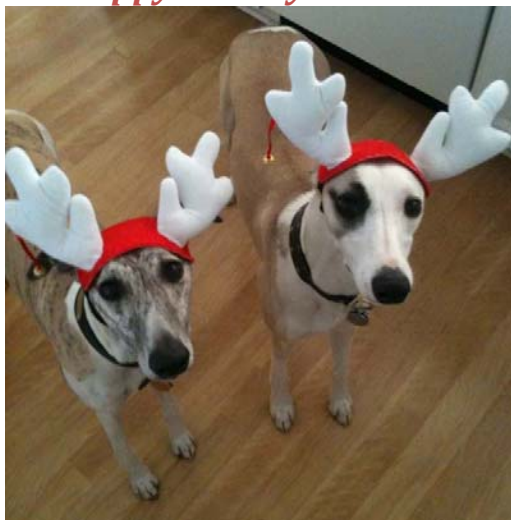
"Monty" Tangens Two For The Road (litter 08) with step brother Hunter ready for Christmas