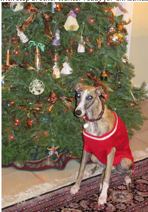
"Tiger Lily" Tangens Red Spectrum (litter 09)