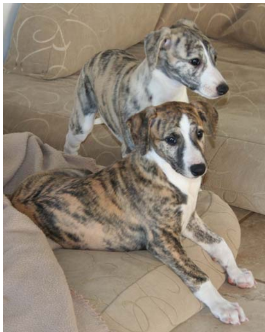
Our latest puppies are growing up!

www.VetLive.com is one of probably many to come internet veterinarians. The vets can't do any procedures over the internet, but they may be good for getting a second opinion or advice in the comfort of your home.